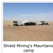
Shield Mining's Mauritania camp

The bid, which has won the unanimous support of the Shield board in the absence of a superior bid, will add Shield's Mauritanian prospects to Gryphon's existing west African projects and leave the combined company with around $23 million in cash to pursue its exploration programs.