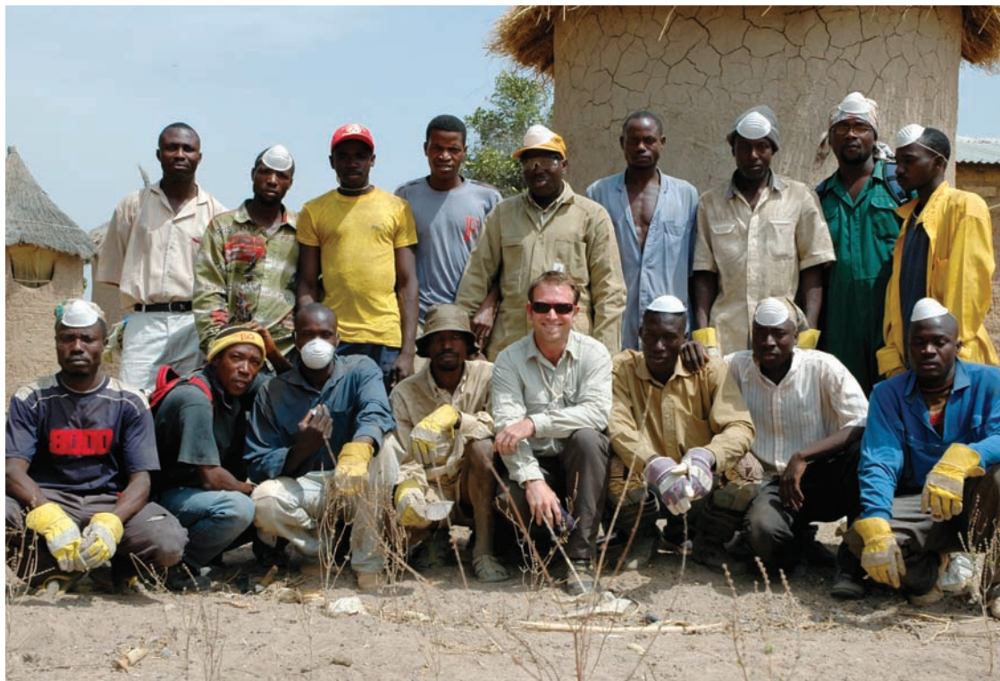
Gryphon’s site team at Burkina Faso

The final peg in Gryphon’s development program is the